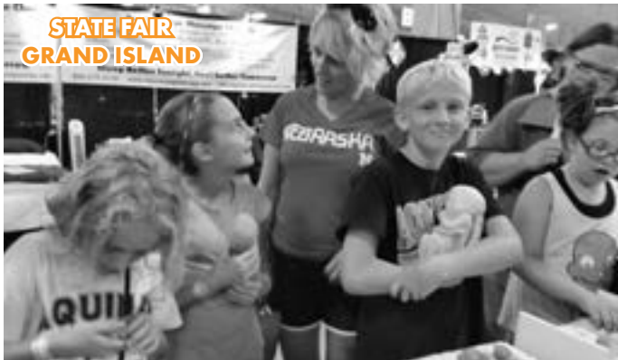
STATE FAIR GRAND ISLAND

Attendees visit the Nebraska Right to Life booth.