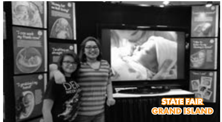
STATE FAIR GRAND ISLAND

Attendees visit the Nebraska Right to Life booth.