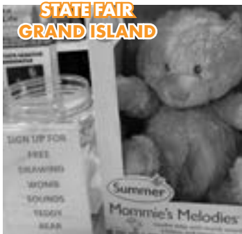
STATE FAIR GRAND ISLAND

Grand Island students work the NRL Booth