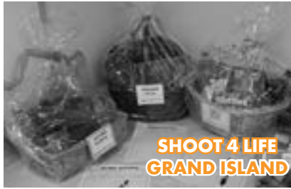
SHOOT 4 LIFE GRAND ISLAND

Nebraska Right to Life donated silent auction baskets.