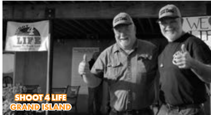
SHOOT 4 LIFE GRAND ISLAND

Nebraska Right to Life donated silent auction baskets.