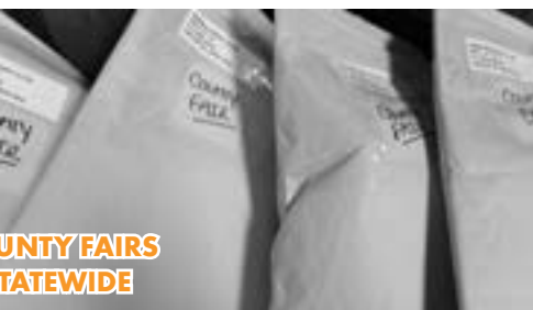
COUNTY FAIRS STATEWIDE