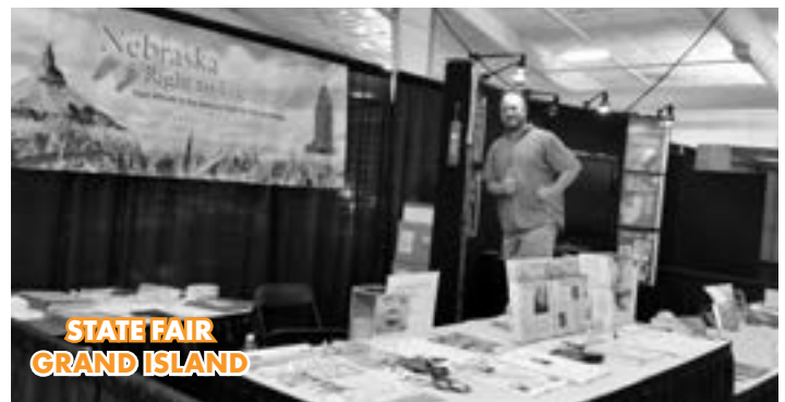
STATE FAIR GRAND ISLAND

Many stop by the State Fair booth with their little ones.