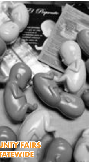
COUNTY FAIRS STATEWIDE