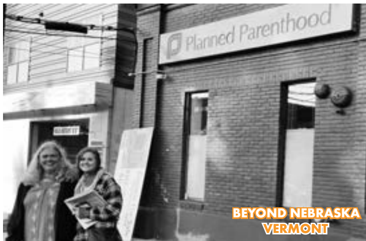
BEYOND NEBRASKA VERMONT