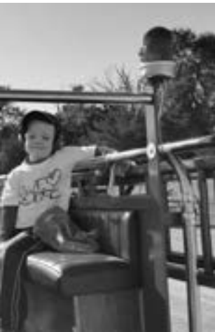
old fire truck