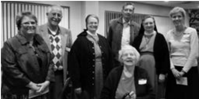
Hastings dinner attendees