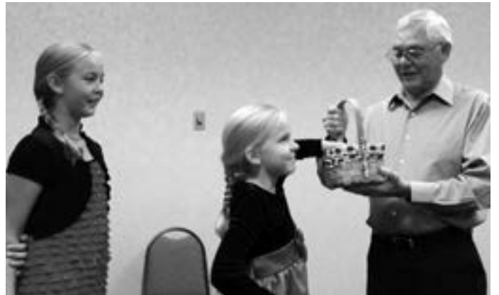
Helpers assist with door prize drawings.