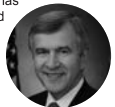
Sen. Mike Johanns

House bills are based upon the NRLC model legislation, which first passed in Nebraska in 2010 and has subsequently passed in nine other States. The legislation bans abortion at 20 weeks based upon an unborn child's medically documented ability to feel pain.