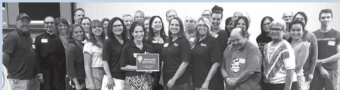
New sidewalk advocates are trained in July.

The Lincoln, Nebraska, affiliate of Sidewalk Advocates for Life (SAFL-Lincoln) began September 10, 2019, with an in-person training. SAFL-Lincoln's ultimate goal is for sidewalk outreach to be present outside Planned Parenthood of Lincoln (PP-Lincoln) during its open business hours. SAFL-Lincoln serves as a gateway from PP-Lincoln to Lincoln's three pregnancy resource centers (Women's Care Center, Pregnancy Center and Birthright) and other life-affirming alternatives.