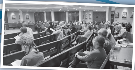
Parishioners pray at St. Michael’s Church in Hastings.

Let’s begin with what a chemical abortion is. The term often used by the abortion provider and the press is a “medication abortion.” This is an inaccurate term. Medication is something that assists someone in medical need, a positive necessity for a patient in need of medical treatment. There is nothing positive about RU486 or chemical abortions. It is a method of killing a preborn child and traumatizing the mother carrying that child.