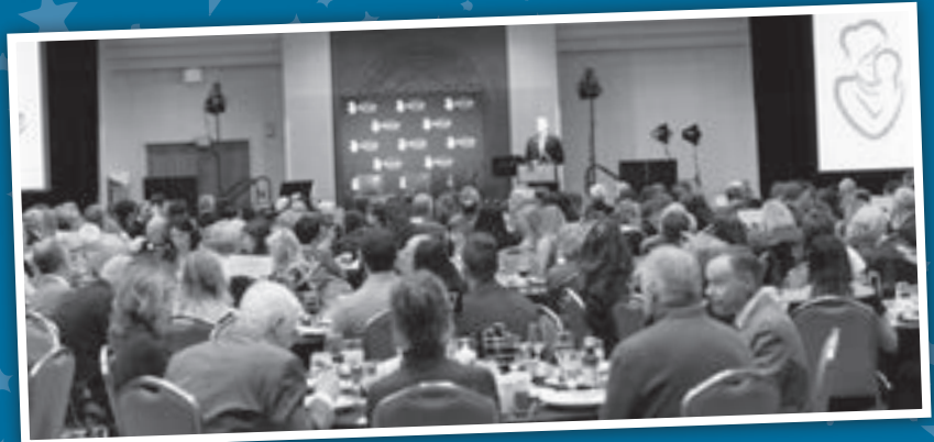
Thanks to everyone who participated in the Jan. 27 Nebraska Walk For Life, below left, and those who attended the Gala the night before, above.